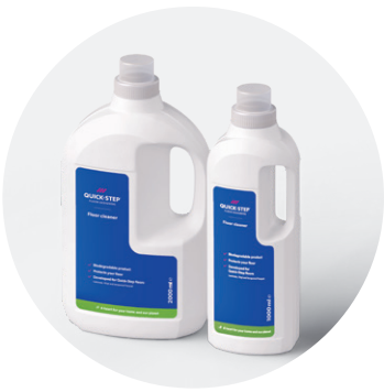
Floor cleaner 1 L or 2 L QSCLEANECO1000 QSCLEANECO2000