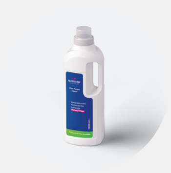
Oiled Parquet cleaner QSWOILCLEAN