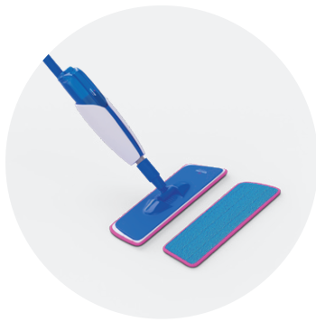
Cleaning kit QSSPRAYKIT