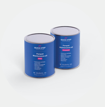
Maintenance oil 1 L QSWMAINTOILN / QSWMAINTOILW