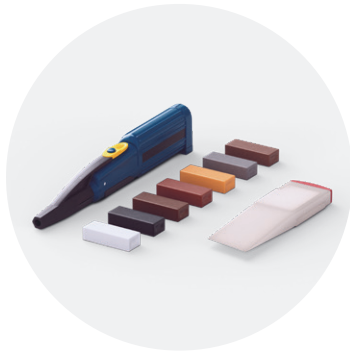
Repair kit QSREPAIR